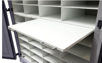
Pullout Work Surface