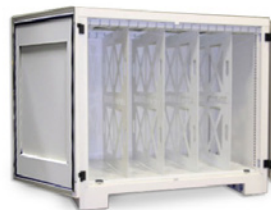
Vertical Art Dividers