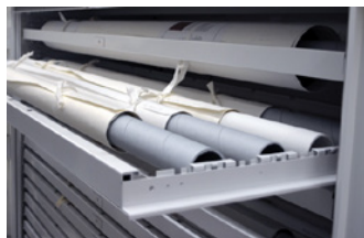
Rolled Textile Drawer