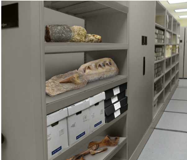
Museum Cabinets and Wide-Lok Wide Span Shelving on Mobile Carriages

In addition to Museum Collections Cabinets, Aurora has many other storage solutions such as Art-Stor Art Rack, space efficient Aurora Mobile, sturdy Quik-Lok Shelving, Wide-Lok Wide Span Shelving, and Aurora Library Shelving for research centers.