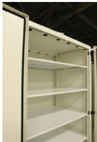
Full Width Adjustable Shelves