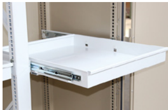
Drawers with Full Extension Slides

* Adjustable on 3/4" increments. Drawer Slide Capacity 200 lbs.