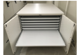
Full Width Pullout Shelves with Extension Slides