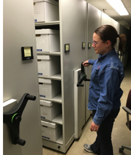
Archival Material on Mobile Carriages